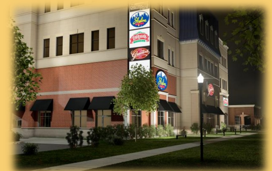
TAYLOR MILL TRIFECTA

Come to experience Taylor Mill for yourself. You'll want to call it home.